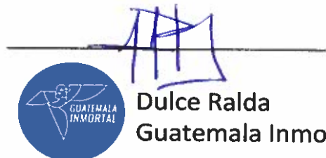
Dulce Ralda Guatemala Inmortal